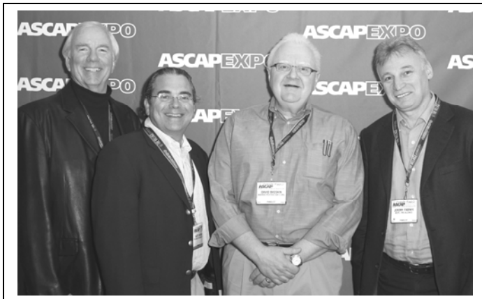
HFA'ers were on two panels at the third annual ASCAP Expo in Los Angeles.