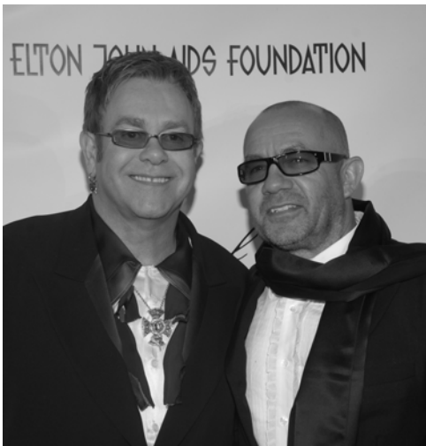
Elton John and Bernie Taupin

Universal Music Publishing Group (UMPG) has signed two new long-term exclusive, worldwide agreements to administer the post-1974 publishing interests of world-renowned, multiple Grammy-winning singer/songwriter/ composer, Elton John , and renowned songwriting collaborator, Bernie Taupin . Each songwriter controls his own interest in the songs they've written, and separate arrangements were entered into with each. As UMPG already owns the copyrights in Elton's and Bernie's songs written up to 1974, these new agreements will put the entire Elton John catalog under one roof, making this a landmark publishing agreement.